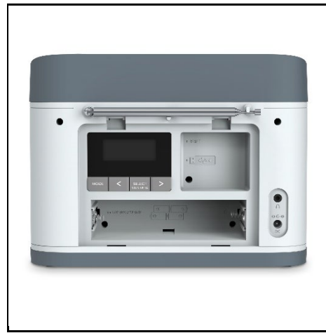
Includes UK, USA and EU adapters. Can be mains powered or used with four D batteries.