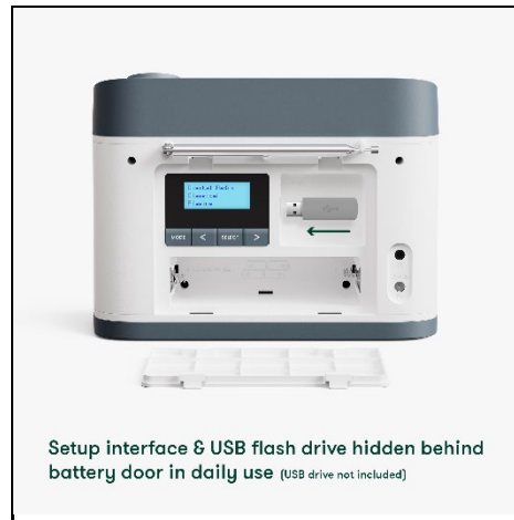
Setup interface & USB flash drive hidden behind the battery door.