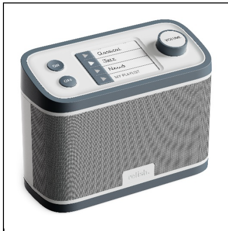
Simple, high-contrast controls with audio feedback.